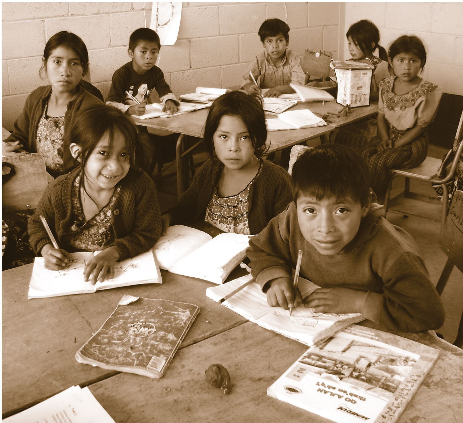
Room to Learn - A few of the students in their new school in El Rio

School construction was completed in the community of El Rio, Guatemala ensuring the right to learn for 360 indigenous Mayan-Mam children.