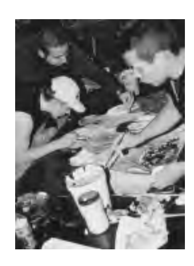
Photo above: Youth from Alberta and Nicaragua painting at Youth Summit 2000