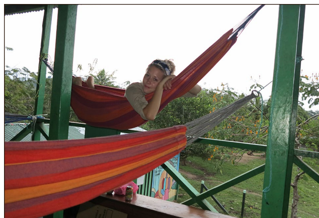
The Casa Verde makes the remote Bosawas rainforest and the communities on the banks of the Coco River accessible to adventurous visitors.

The potential for ecotourism to conserve environments, educate travelers, and sustain vulnerable communities means a positive impact in the fight against both ignorance and poverty.