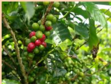
Coffee – the plant and the drink:

Place the pictures on a map to show where the various foods come from in the world.